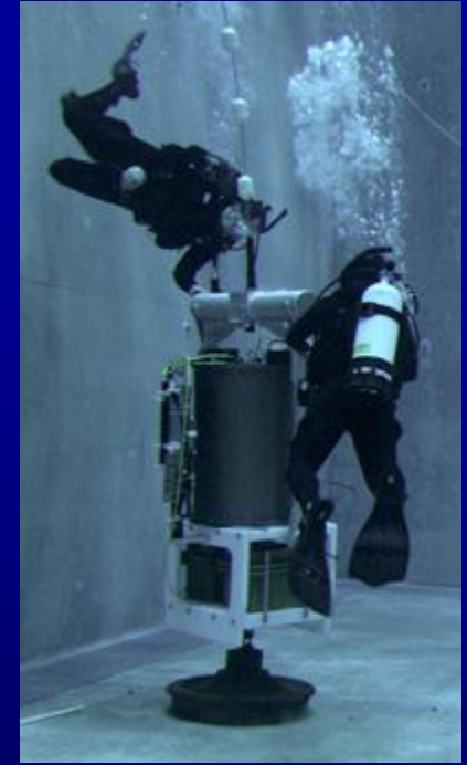
Divers and ESP in test tank

In situ electromechanical/fluidic system samples and concentrates microorganisms or particles