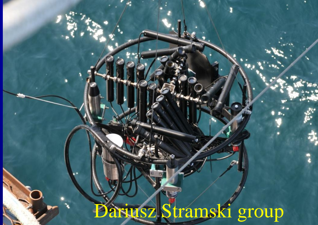
Dariusz Stramski group

Below. NPOL meas. full downwelling polarized spectral radiance distribution