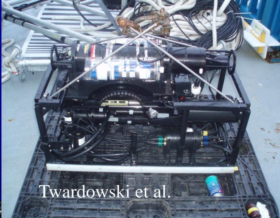
Twardowski et al.

Right. MASCOT used for 1st comprehensive scattering (incl. 17 angles), absorption, CTD, and optical bubble observations. Also, linear polarization elements of VSF.