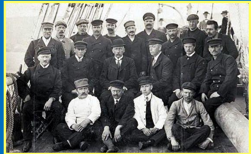
Amundsen, 'The Chief', in center