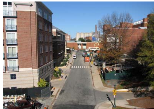
C: Jeanette Lancaster Way existing conditions