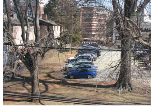
B: South Lawn connector existing conditions

C3: Consider developing Deans' offices and related areas as part of an addition to the Health Sciences Library fronting Lane Road and facing the new academic quad.