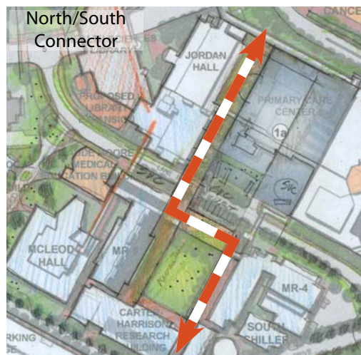
D: Location of north-south connector