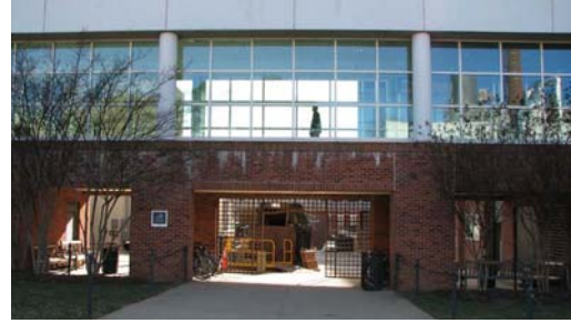
D1: Looking south toward the link and Jordan Hall/Primary Care Center alley

D5: Enhance the at-grade, tree-lined connector between Medical Research Unit 4 (MR-4) and the new terrace/connector to link Crispell Drive and the South parking garage to Lane Road.