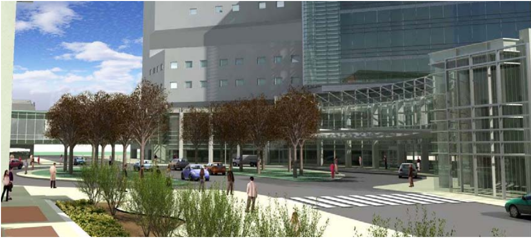
C: Rendered view of the hospital from the Emily Couric Cancer Center with the Hospital Bed Expansion and Lee Street connective elements