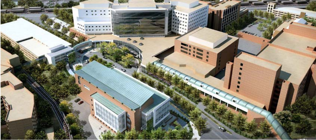
C: Conceptual rendering of the future Lee Street corridor