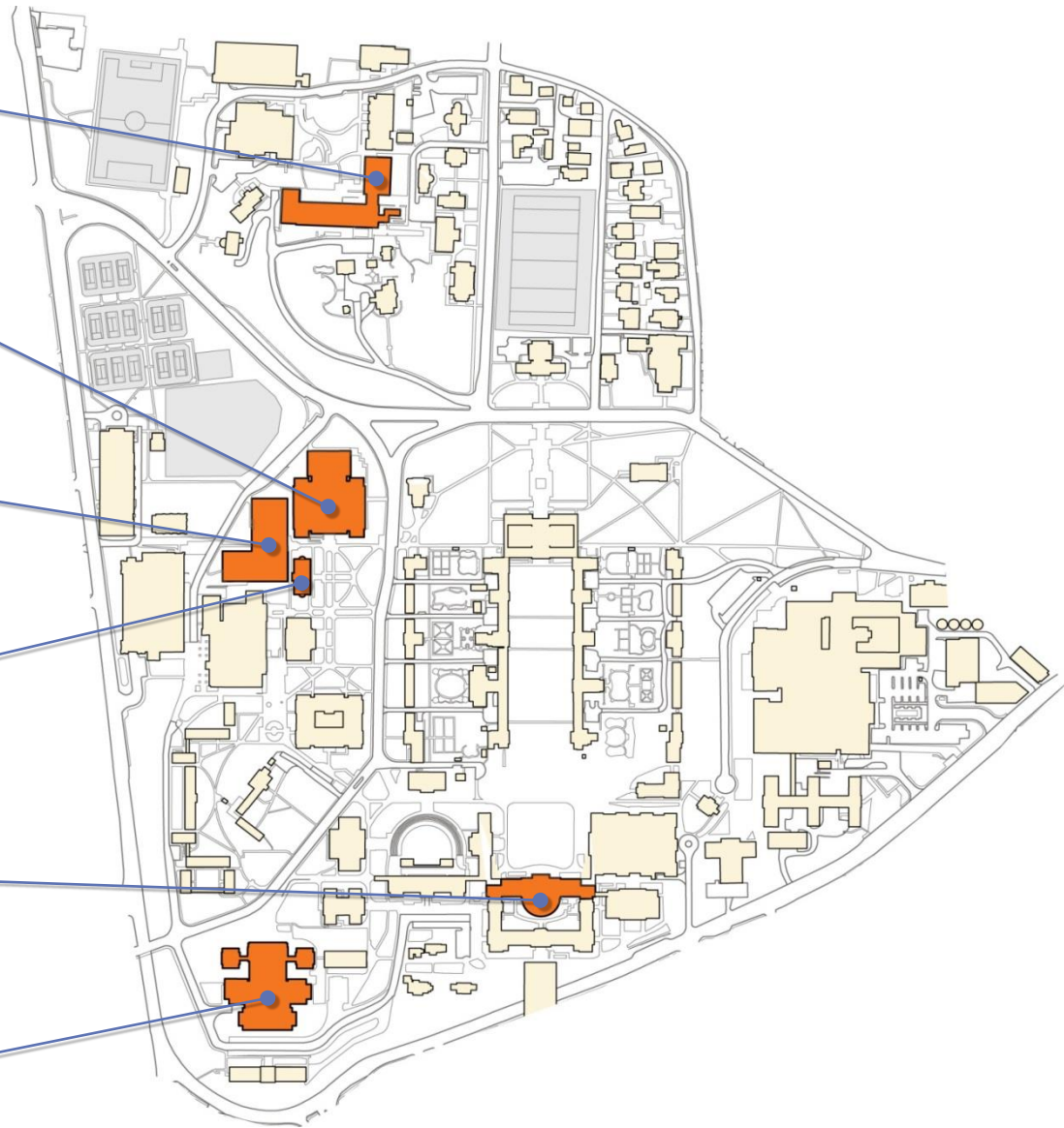
A Study of both Alderman, and the Library as a System