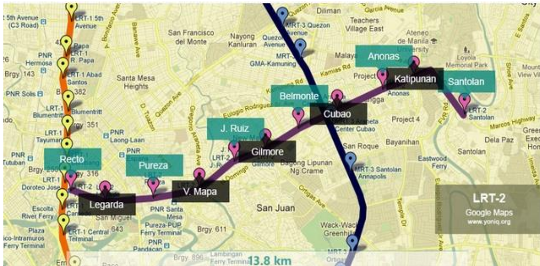
Figure 1. MRT-2 Stations

terminal) [1, 11]. Ten (10) stations are elevated and one (1) station (Katipunan) is underground.