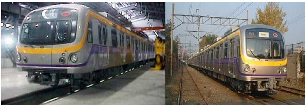
Figure 2. The Megatren or MRT-2 Trains

Each train is 92.6 meters long and consists of four motorized cars. Gangways at the short ends of the cars allow passengers to move through the whole train [3, 7]. One train has the capacity of 232 passengers seating in longitudinal bench type fiberglass reinforced plastic and 1,396 standing passengers, i.e. total of 1,628 passengers per train set shown in Figure 3.