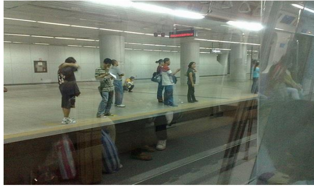
Figure 3. MRT-2 Platform

All stations are barrier-free inside and outside the station, and trains have spaces for passengers using wheelchairs.