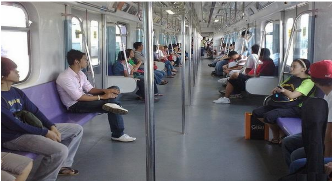
Figure 3. Inside an MRT-2 Train

The trains have 2 units of roof mounted air-conditioning system per car. Announcement of the next station will be done automatically over the PA system, which can also transmit music for entertainment in the passenger's compartment. The trains are electrically driven using the solid state propulsion compartment. Braking energy will be regenerated to the over power line, thereby reducing the energy consumption significantly [4, 11 ,13]. A signaling system will ensure full safety during operation. The train will be operated automatically by an ATO system (Automatic Train Operation). A train attendant will supervise each train.