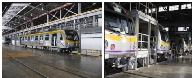
Figure 4. MRT- 2 Depot

The depot is capable of storing multiple electric multiple units, with the option to expand to include more vehicles as demand arises. They are parked on several sets of tracks, which converge onto the spur route and later on to the main network