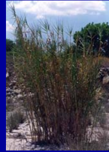
Arundo donax : Giant Reed