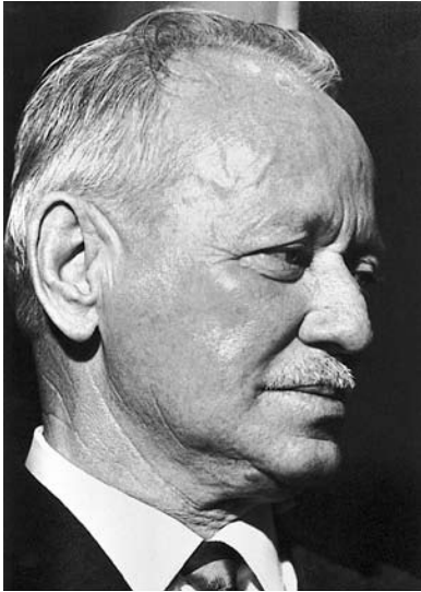
Mikhail Sholokhov (1905–1984), Nobel Laureate 1975.