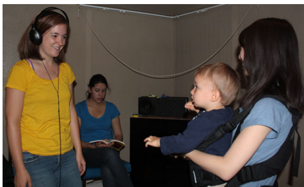
Figure 1. Experimental set-up for the interpersonal movement phase. The assistant holds the infant facing forwards towards the experimenter, while the neutral stranger sits within the line of the infant's sight, reading silently. (Online version in colour.)

that the movement of the experimenter did not influence her ability to bounce to the underlying beats in the song played over loudspeakers [45]. The interpersonal movement phase began when the song files started playing and ended when they stopped and was therefore 140 s in duration.