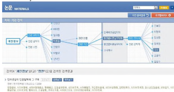
Fig. 5 Dynamic Paper Information Tracking Service

The first service is an international legislation information map service. As shown Fig. 4, this service compares similarity of legislation information in various country such as US, Japan, UK, France, Germany, and EU. In the first step of this service, iLaw automatically extracts 10 related terms from Korean Law by pre-established logics which are consists of relationship to user's keyword, value of Topic class, and co-occurrence analysis. In second step, the terms are translated into 6 languages and translated terms are used for checking whether those are or not in 6 national legislations. If a related term is in some national legislation, iLaw gives the term 1 score. After gathering all scores, iLaw shows International legislation Map and we can get specific information that some national legislation is similar to us within user's keyword field.