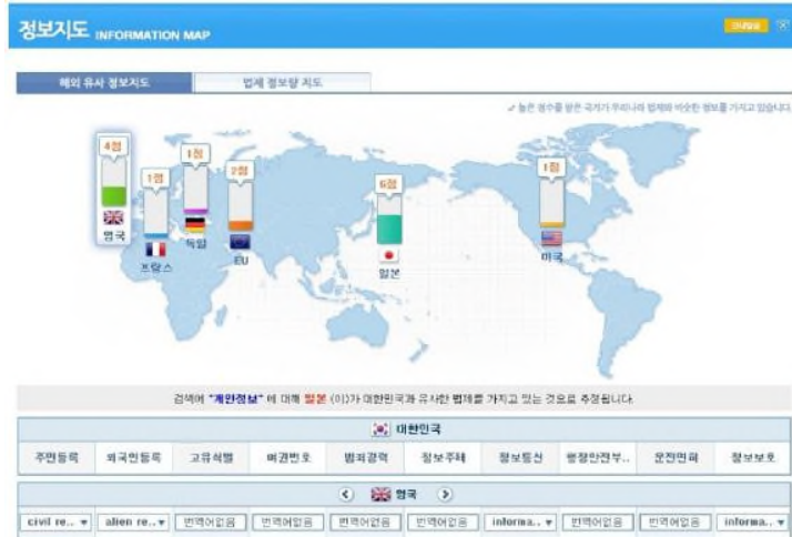
Fig. 4 International Legislation Information Map Service

The first service is an international legislation information map service. As shown Fig. 4, this service compares similarity of legislation information in various country such as US, Japan, UK, France, Germany, and EU. In the first step of this service, iLaw automatically extracts 10 related terms from Korean Law by pre-established logics which are consists of relationship to user's keyword, value of Topic class, and co-occurrence analysis. In second step, the terms are translated into 6 languages and translated terms are used for checking whether those are or not in 6 national legislations. If a related term is in some national legislation, iLaw gives the term 1 score. After gathering all scores, iLaw shows International legislation Map and we can get specific information that some national legislation is similar to us within user's keyword field.