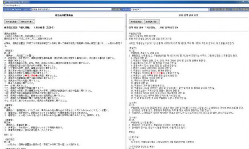
Fig. 7 Real-time Japanese-Korean Translation Service

about Japanese legislation are represented in Japanese and also translated in Korean. Detailed search result is also illustrated in Japanese and Korean simultaneously.