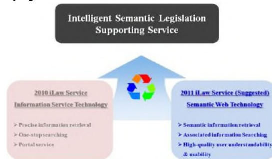
Fig. 3 Role of Intelligent Semantic Services

In the suggested System, we design 4 new semantic services. Conventional iLaw supported some low-level intelligent services and simply searching legal information like a search-engine portal. However, low-level intelligent services and simple searching legal information didn't touch users and they asked us to introduce higher leveled services into iLaw. Therefore, we need more intelligent service for satisfying with diverse needs of users.