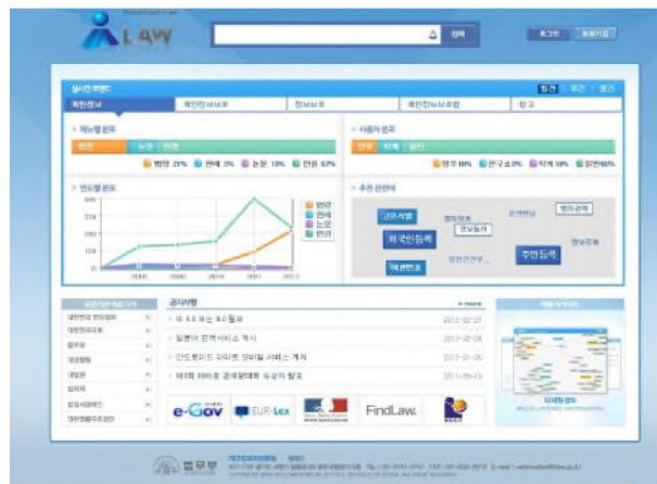
Fig. 1 iLaw Main page

In this paper, we introduce a system which is wholly new in providing enhanced intelligent services based on semantic data modeling. The suggested system has 4 new semantic services international legislation information map service, dynamic paper information tracking service, related term-based associated legislation information service, and real-time Japanese-Korean translation service. By newly adopted 4 semantic services, the system can support more high-level intelligent service and maximize user's semantic service experience and understandability with various kinds of legal information.