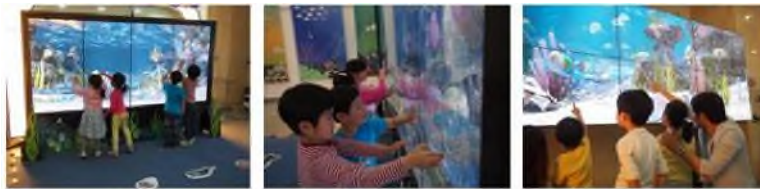
Fig. 2. Smart Big Board Pretest

The questionnaire was designed 1 question for each evaluation item to answer yes, no, or no response about the importance of each items for quantitative evaluation. The evaluation is not aimed at deduct the accurate numerical value data but find out the relative importance on the guideline suggested by this thesis.