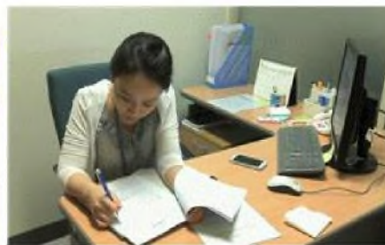
Fig. 4. A scene of analysis of experimental data