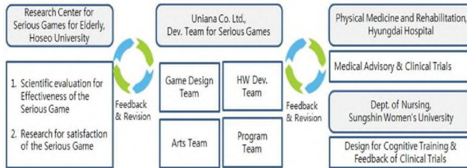
Fig. 2. Organization and Roles in the Development and Advisory