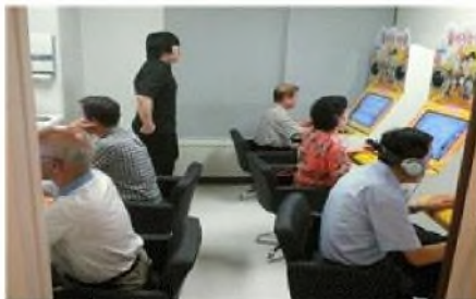
Fig. 3. A scene of clinical trials