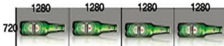
Fig. 2. A proposed image generation method