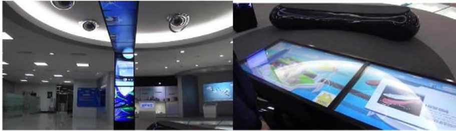
Fig. 4. Display implementation image Fig. 5. Touch input implementation image

This work is a work that connects large display of 3840*1080 at touch input terminal to the display of 8960*720, development of multi-vision common in our neighborhood through network.