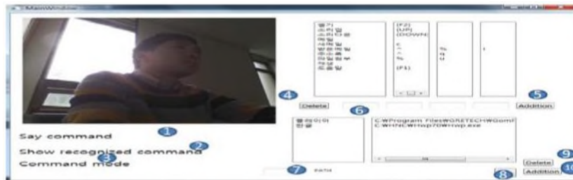
Fig.2. Execution screen.

Figure 3 shows the screen of our program and the run program which is executed by voice command register. In previous voice command interface [4], developer must define all commands and corresponded execute program by providing command voice and execute program' path in the source code. However, this command register interface provide user to add new command to execute the program he wants.