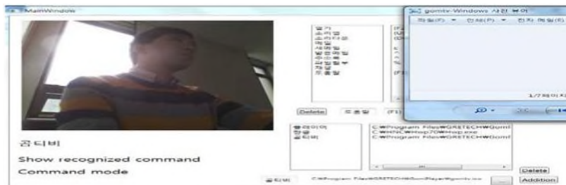
Fig.3. Execution command register screen.

Figure 3 shows the screen of our program and the run program which is executed by voice command register. In previous voice command interface [4], developer must define all commands and corresponded execute program by providing command voice and execute program' path in the source code. However, this command register interface provide user to add new command to execute the program he wants.