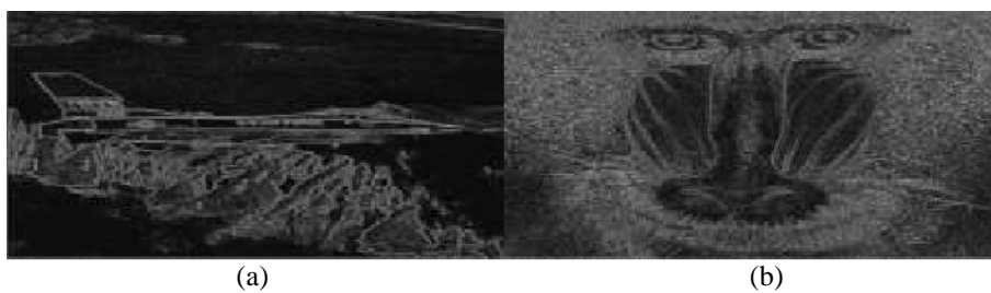
Figure 2 shows obtained Shannon entropy map.