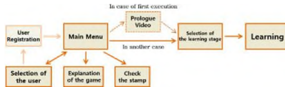
Fig. 4. Block Diagram of an Application

The proposed application aims at teaching some certain basic shapes to the children from 4 to 7 years old. Specifically, this application is designed to train ten basic shapes as shown in Fig. 3. This application covers a form of storytelling, and through the story, the children can learn these shapes answering various questions.