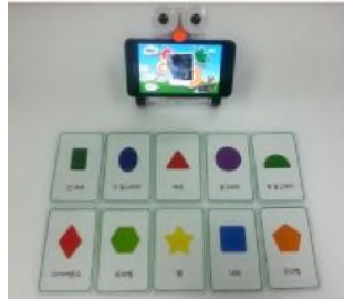
Fig. 3. Model of a Figure Learning Application