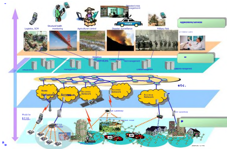
Figure 1. Structure of the Internet of Things NGN,