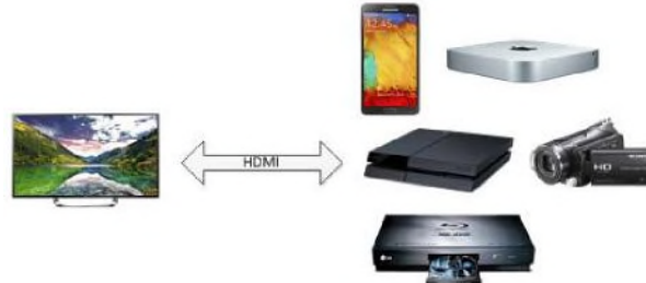
Fig. 1. Example of the HDMI connections