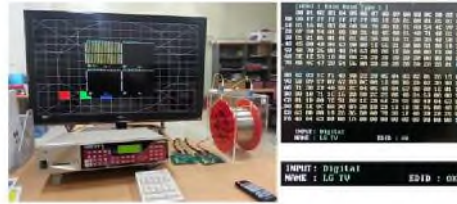
Fig. 6. EDID test