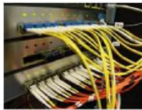
Fig. 2. Example of the HDMI connections

Fiber-optic communication is a method of transmitting information from one place to another by sending pulses of light through a fiber-optic cable. The light forms an electromagnetic carrier wave that is modulated to carry information. An example of the fiber-optic communication system is shown in Figure 2.