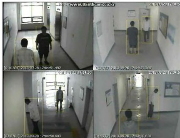
Fig. 4. HOG Human Detection 4 Camera

Figure 4 shows method applied in Unity 3D game engine. The smoke follows stairs to up floor [8]. Unity 3D particle system initialstheseparticles to upper space. The High Rise building model mesh indivisible outline. Simulation size is box mesh. Smoke coordinate flow FDS result [9] to show.