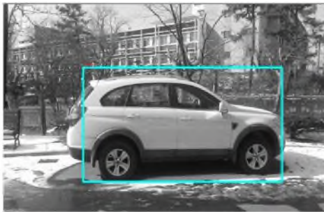
Fig. 1. HOG car detection

The paper is main goal is found what object in a video surveillance system. If detection the object and recognition object is easy improve algorithm and surveillance camera system performance[3]. Figure 1 shows car detection and Figure 2 shows human body detection. Naturally Car and human are different. But, the method of car detection program is very similar with the way of the detection program of a cat and dog. In detection system each object has 5 same features (car bodies, tiers like animal bodies and foot). So from the 1st finding of the object's size is more important than pattern recognition. The 2nd finding use of pattern recognition detection object 3rd activity analytics. Detection environment dynamic light and static light is main target. 1st our algorithm find object feature point from feature we find object silhouette. Second we need make 3D scene from real world. And that task need very easy, very simple, and cost need very low[4,5]. From surveillance system need make visualization scene to visualization about real world problem.