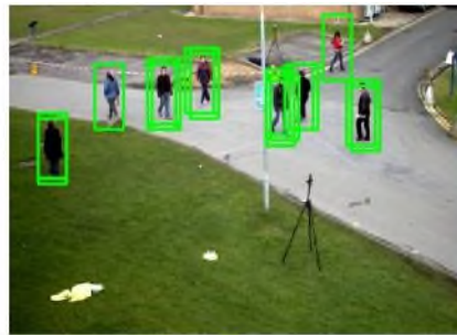
Fig. 2. Human Body Detection