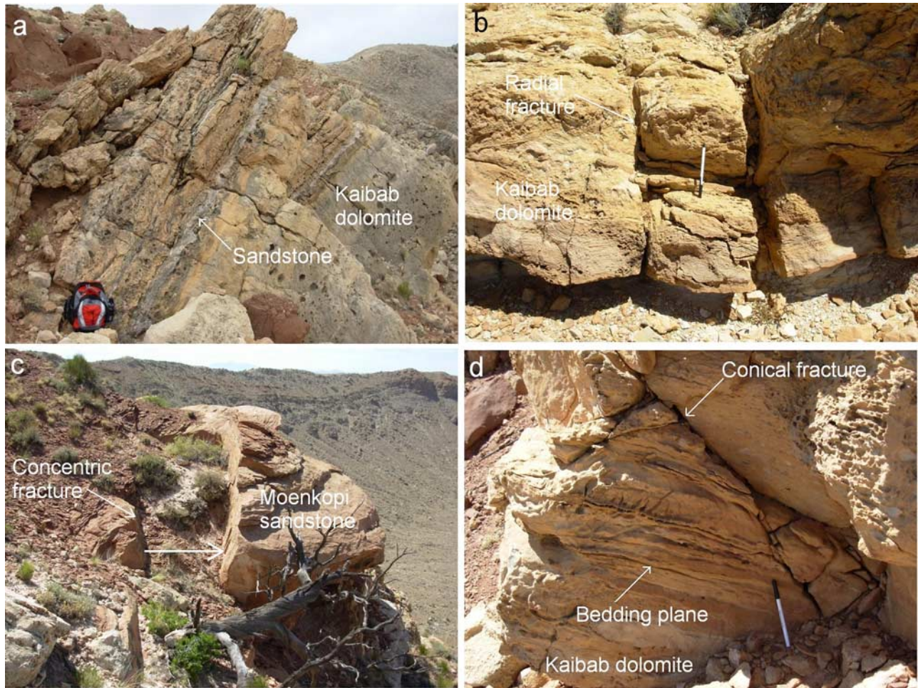
Figure 4. Crater wall pictures showing (a) outward dipping bedding planes of the Kaibab dolomite that expose traces of fractures; (b) radial fractures in the Kaibab dolomite; (c) a trace of steeply dipping concentric fracture in the Moenkopi sandstone showing slumping; and (d) a conical fracture in the Kaibab dolomite cutting the bedding planes.