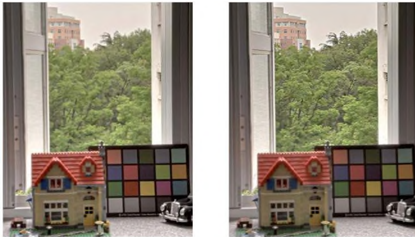
Fig. 3. Result images; (a) iCAM06 image, (b) the proposed image.

Result images are shown in Fig. 3. Sharpness in proposed image is clearly better than that in iCAM06. In particular, this enhancement through proposed method is obvious in center of image in an outdoor part. Because of pre-processing, defect of noise in dark area isn't seen.