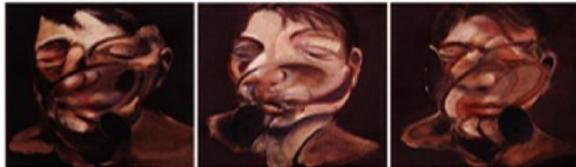
Fig 2. Francis Bacon's Art Painting used as the Technical Concept of Sensibility Expression [2]