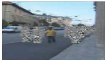
Fig. 5. Privacy Protection Technique using a obfuscation Technique (Pixelization) [2], © EMITALL Surveillance SA

Figure 5 displays an example which the image in a sensitive area is kept from being identified through the 'pixelization' method to protect privacy. In comparison, Figure 6 shows the direction similar to pixelization in artwork. The formative beauty can be identified in Figure 6 as compared with the sensitive area which just focuses on the non-identifiability of the image in Figure 5. Also visual balance, the arrangement and the darkness of colors, the control of strength and others are considered to be directed on the full screen in Figure 6. Even though the contents of detailed images are not distinguished in both Figure 5 and Figure 6, the formative principles where people can have emotional satisfaction, seeing the artwork, are used to present beauty to viewers in contrast with Figure 5.