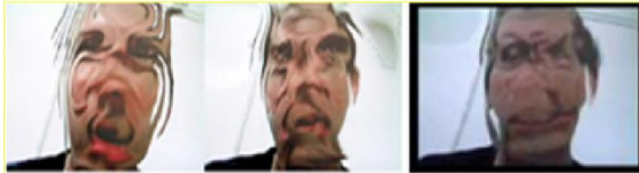
Fig. 1. Alvaro Cassinelli's Khronos Projector, Siggraph Emerging Technology, 2005 [2]

The image contents in Figure 3 and Figure 4 are not identified and protected. The induction of the user's eyes, the harmony of colors and others are considered to be expressed through the screen density, gradient effects, emphasis and omission on the screen and others in Figure 4 in contrast with simple and boring expression in Figure 3.