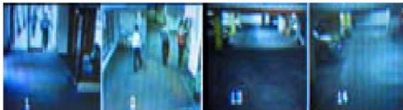
Fig. 3. Privacy Protection Technique using a Obfuscation Technique (Blurring), © Boannnews [4]