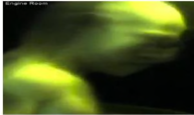
Fig. 4. An example of the Artwork which can be directed with Blurring Techniques, Paul Hellard's artwork, Siggraph 2011, © the Association for Computing Machinery, Inc. [5]