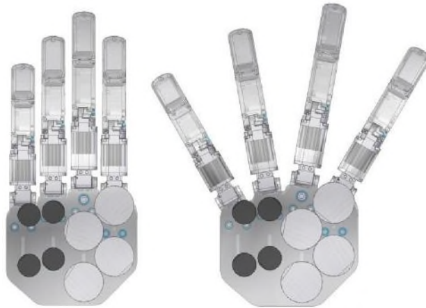
Fig. 1. CAD design of proposed robotic hand

When violinist plays the violin, the exact sound is generated by not only locating the bow on the correct string, but also pressing the string with the correct amount of force. Fig. 1 shows the design of proposed robotic hand. To determine the amount of applied force on the string like humans, the 3-axis load cell with strain gauge is designed and integrated at the finger tip.