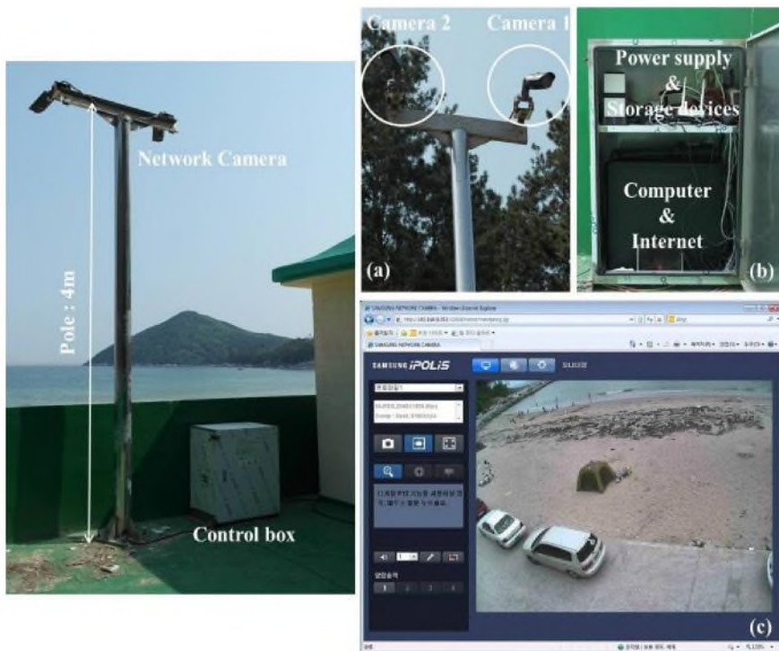
Fig. 2. The structure of the network camera system: (a) a network camera setting on a 4-m-high pole (SNO-7080R), (b) the structure of the control box, and (c) the web browser for real-time monitoring.

Heungnam Beach is located on the southeast coastline, and the left side of the beach is wider than the right side. In this study, to monitor a wide area, we established network cameras on top of the left side of a building (Fig. 1). We also erected a 4-m pole and set up two cameras facing left and right to maximize the photography area and angle (Fig. 2a). We also established a control box including a server, which was capable of real-time monitoring and controlling a high-definition video surveillance network, terabyte (TB) storage, a power supply, and Internet router (Fig. 2b). This server not only acted as a digital video recorder but could also assess storage, the Internet environment, and the operational state of the cameras. Beach litter monitoring took place from 1 January to 31 December 2013 using the network cameras. The cameras observed through the Internet connection a remote PC (in the laboratory) could monitor the beach status in real time. Each network camera was allocated a private IP address, which facilitated access to the monitoring videos using a web browser (Fig. 2c).