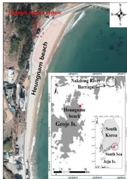
Fig. 1. The location and shape of Heungnam Beach on the southern coast of Korea (red circles indicate the locations and areas photographed by the network camera system).

Remote monitoring of beach litter was undertaken at a site on Geoje Island, in the south of Korea (Fig. 1). Heungnam Beach is located in the northeast of Geoje Island, and has a length of 350 m and a width of 30 m. Its slope is gentle and it has a monotonous sandy surface. Every year, this island is affected by fishery-based litter caused by Styrofoam buoys and trash deposited illegally by tourists. In addition, it is adjacent to the mouth of the Nakdong River, which is the largest river inflowing to the southern sea, with an estimated 2,000 tons of litter flowing to the coast each year [9].